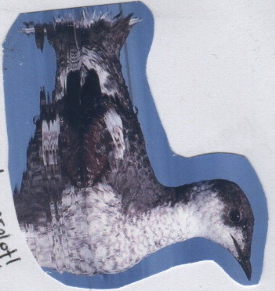
↑ marbled murrelet!