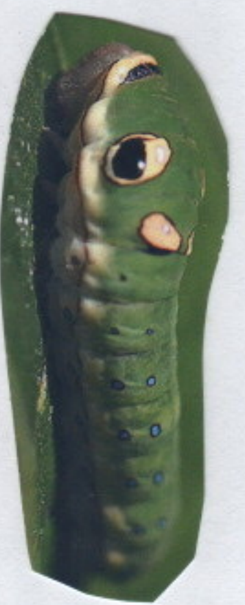
Spicebush Swallowtail! →

Towards also reminds us that both decolonization and reconnecting with the land are ongoing processes, not definitive end goals.