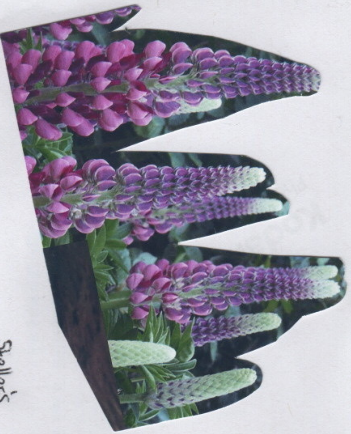
Steller's Jay! -7

"Put your roots down, put your feet on the ground You can hear the Earth sing if you listen 'Cause the sound of the river as it moves across the stones Is the same sound as the blood in your body as it moves across your bones"