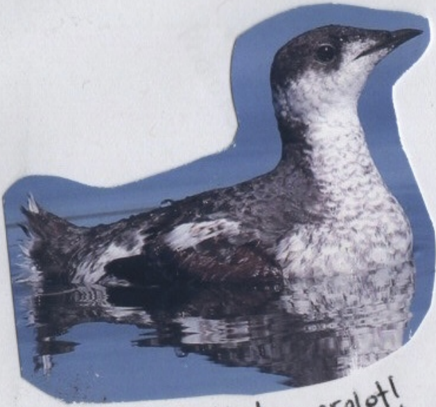
↑ marbled murrelet!